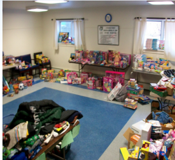
Holiday gift donations at FCC

The holidays have come and gone and we are wishing you and yours a happy, healthy and prosperous 2010. Franklin Community Center would like to thank the incredibly generous community of Saratoga Springs and beyond . We received record numbers of applicants for assistance this year and were able to provide holiday assistance to more than 600 people in Saratoga County. Once again, our community has come together to support their friends and neighbors during the holiday season. Franklin Community Center thanks all of you who participated in helping make the season brighter for our less fortunate neighbors!