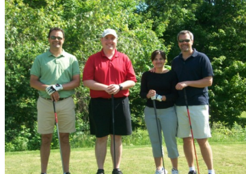
Our 2011 Winning Team!

The Saratoga Springs Rotary Club has awarded Franklin Community Center $7,000 from their Major Gift Program to be used toward energy efficient upgrades for our apartment building, Franklin Community Manor. The money will be used to repair and replace windows, so we can continue to ensure our residents have a safe and comfortable place to live. Thank you to all who helped make the decision!